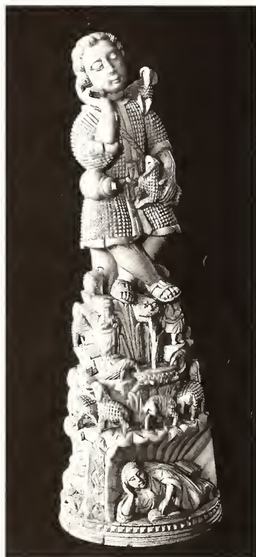
Figure 6. Christ the Good Shepherd , India, probably Goa, ca. 1550–1650. Ivory, 22.5 x 7.4 x 6.6. Museum of Fine Arts, Boston, Gift of E. Royall Tyler, 30.155

furnishings in a subtly hybrid style merging late Renaissance influences and elements of local Hindu temple art. 12 While most of the ivory figurines derive from Flemish engravings of the Madonna, the Holy Family, and the Good Shepherd (see figs. 5, 6), 13 they often transform them according to Indian sensibilities. One of the most precious relics of this period is a rare standing Christ child in rock crystal; despite its size, it is an object of stunning monumentality that recalls Hindu and Buddhist deities in its frontality, symmetry, and blocklike composition (see fig. 7). 14 European artists also worked in Goa. They include the Flemish Jesuit sculptor Father Markus Mach (known as Marcos Rodriguez; died 1601) and the Portuguese Jesuit painter Manuel Godinho (active 1580s), who specialized in reproducing miraculous images of the Virgin Mary supposedly painted by St. Luke (see fig. 8). 15